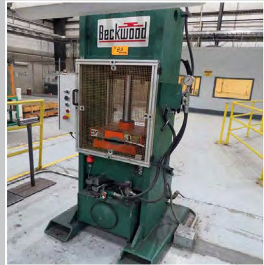
BECKWOOD Tube Expanding Press