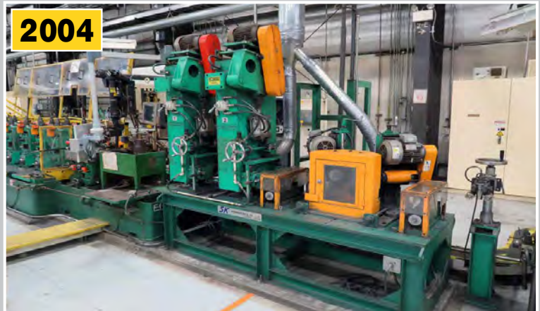
KUSAKABE Rafted Pipe Mill with Tooling