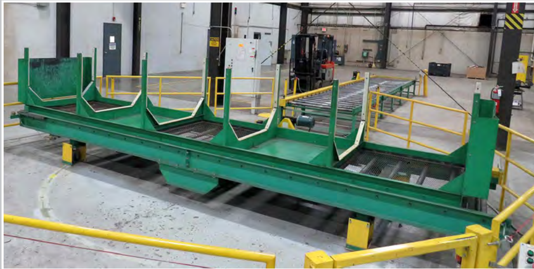
COMMONWEALTH Material Handling Tube Bundle Turning Machine