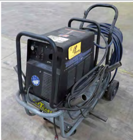
THERMAL DYNAMICS Cutmaster 51 Plasma Cutter