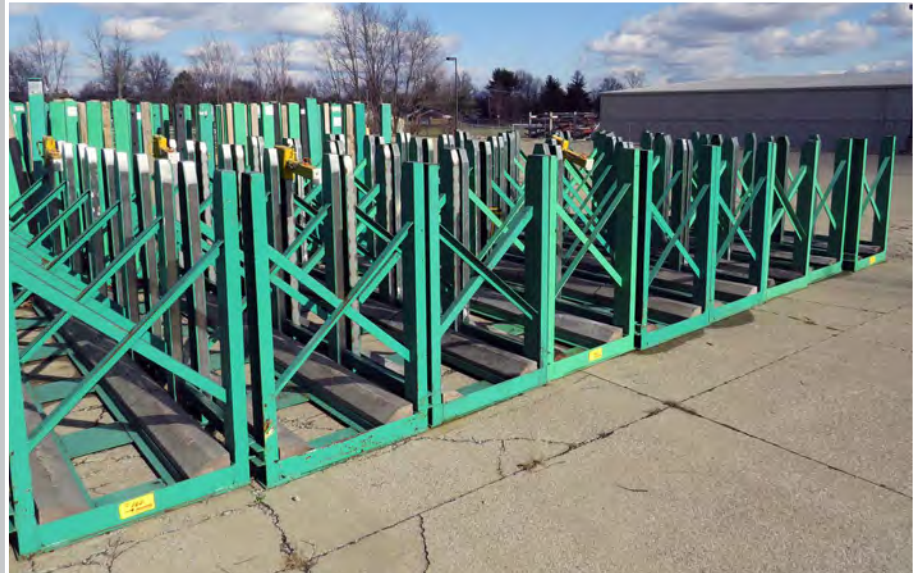
Tube Storage Racks