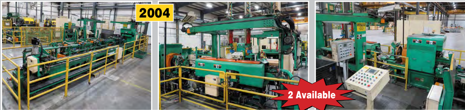
2" KUSAKABE Rotary Tube Recut Machines