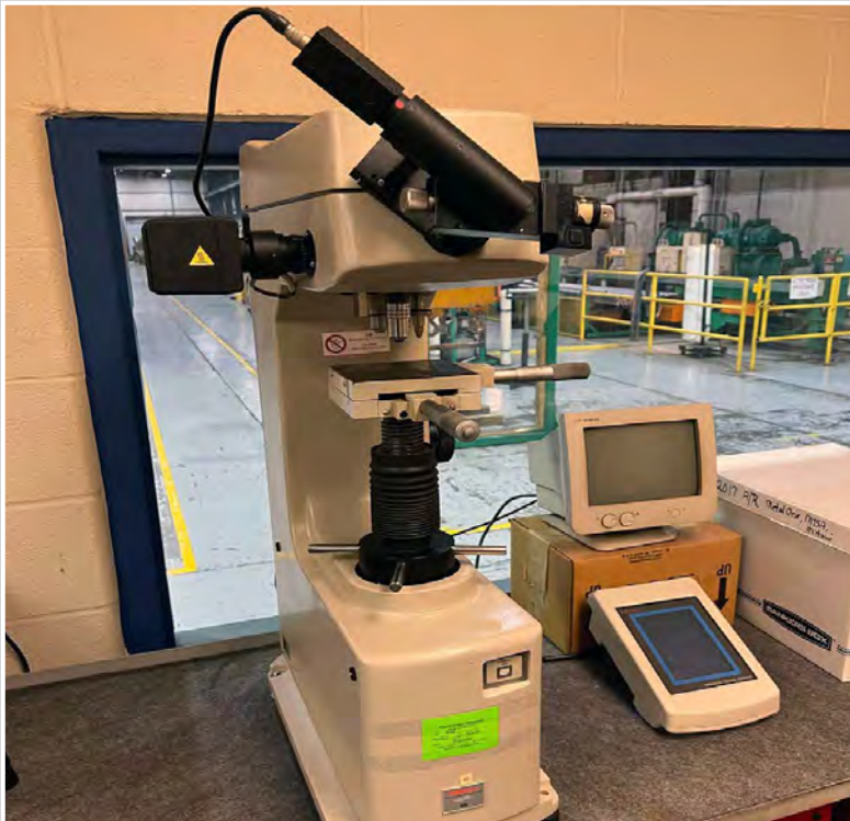
MITUTOYO / AKASHI HV-113 Digital Hardness Testing Machine