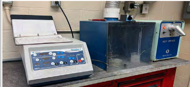
BUEHLER ElectroMet 4 Power Source & BUEHLER EM4