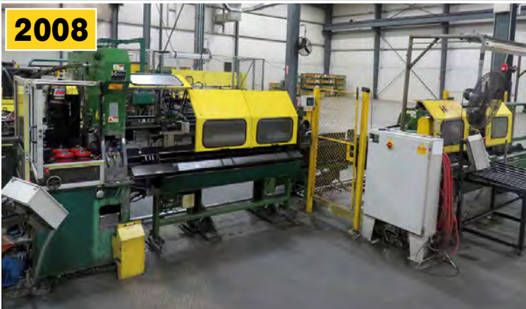
3" HAVEN 873 Recut Machine with End Finishing/Deburring