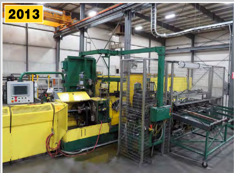
3-1/4" MODERN 3S Tube & Bar Recut Machine