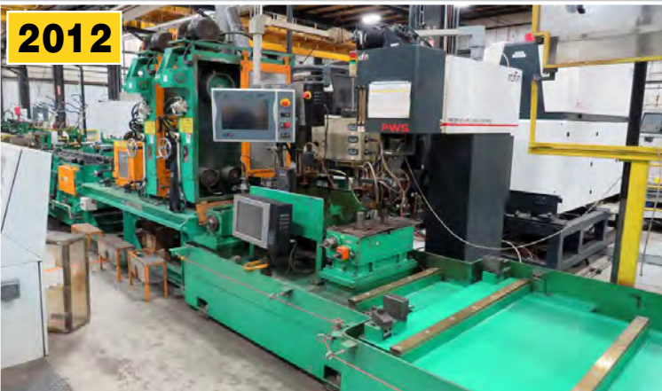
KUSAKABE Rafted Pipe Mill with Tooling