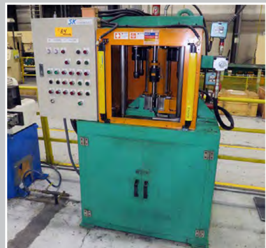
SK Hydraulic Tube Expanding Tester

FOR FURTHER INFORMATION CONTACT: Ken Planet at 248.238.7988 or email Kplanet@maynards.com