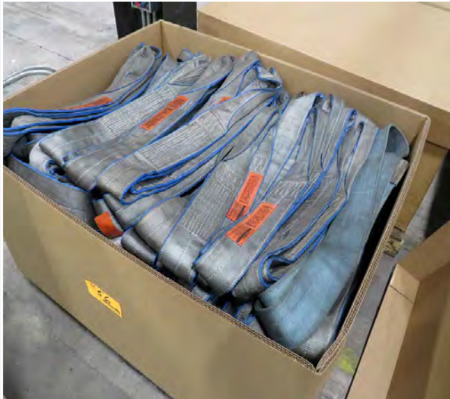
LIFT-ALL Tuff Edge Eye-Eye 4" W x 11' L Polyester Web Slings