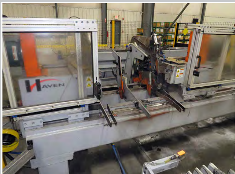
HAVEN Double End Chamfering Machine