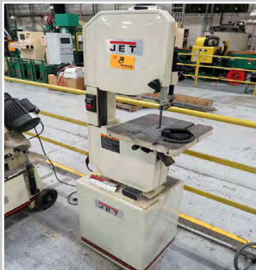
JET J-8201K – 14" Wood/Metal Vertical Band Saw