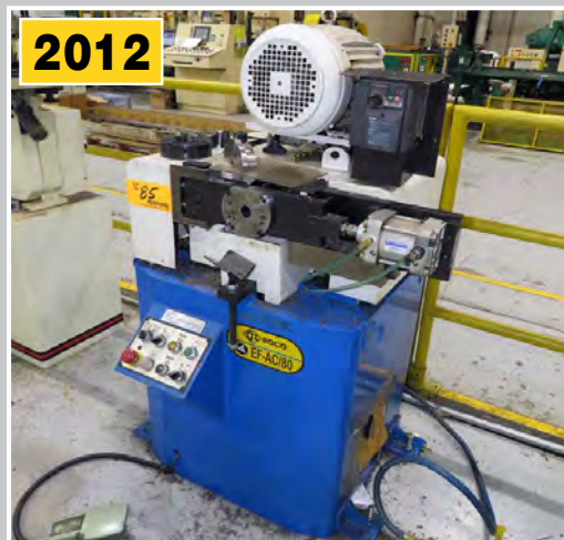
SOCO EF-AC/80 Tube Chamfering Machine