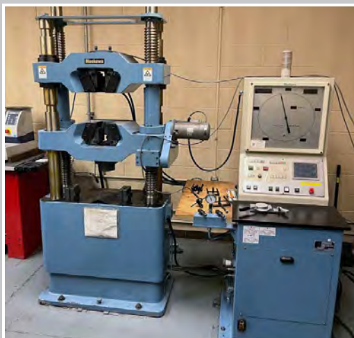
MAEKAWA MRA-50-F2 Tensile Testing Machine