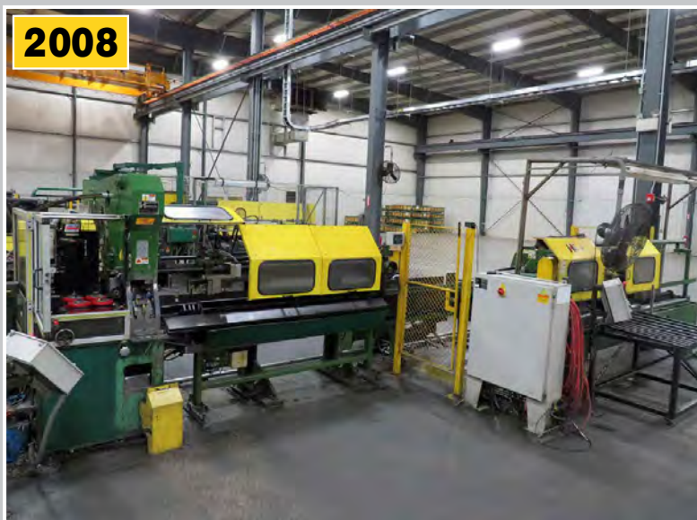
3" HAVEN 873 Recut Machine with End Finishing/Deburring