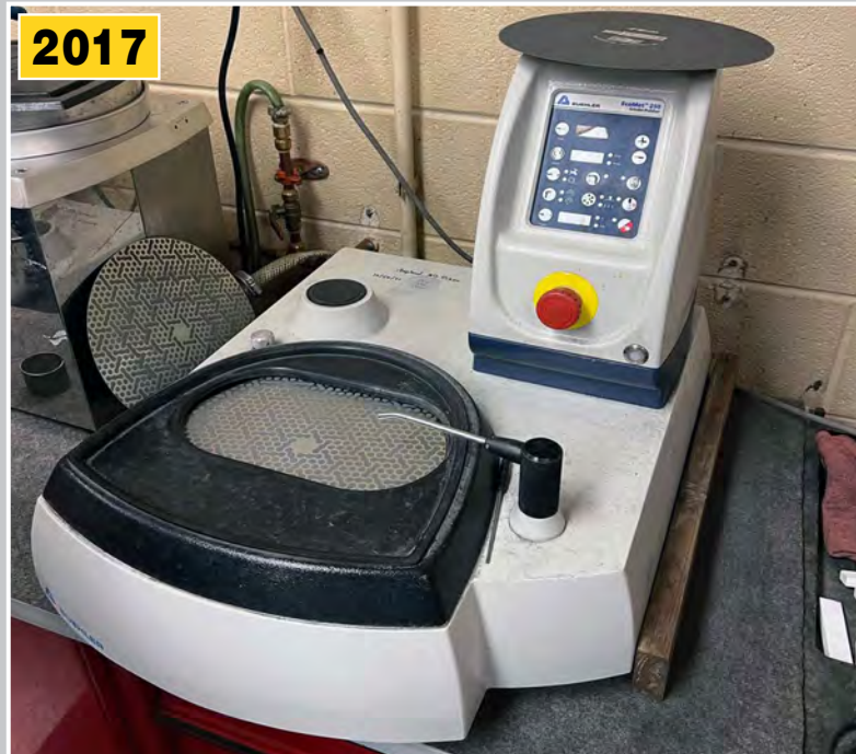
BUEHLER EcoMet 250 Grinder-Polisher