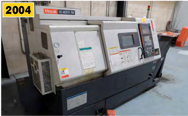
MAZAK Quick Turn Nexus 250 CNC Turning Center