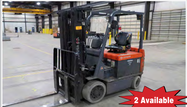
TOYOTA 5,750 Lb. Capacity Electric Forklift